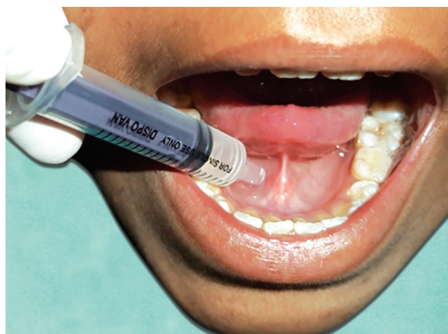
Fig. 1: Method of collection of saliva

Data were collected, tabulated, and put to statistical analysis using SPSS (Statistical Package for Social Sciences) version 15.0 Statistical Analysis Software. The collected data did not have a normal distribution, so nonparametric Mann-Whitney U test was used for statistical analysis. Prerinse and postrinse Streptococcus mutans colonies in saliva were counted at 1:10 , 1:10^2 , 1:10^3 , and 1:10^4 dilutions. There was no statistically significant difference in the mean prerinse colony counts on both occasions of saliva collection. Postrinse results with 0.2% chlorhexidine and 5% propolis