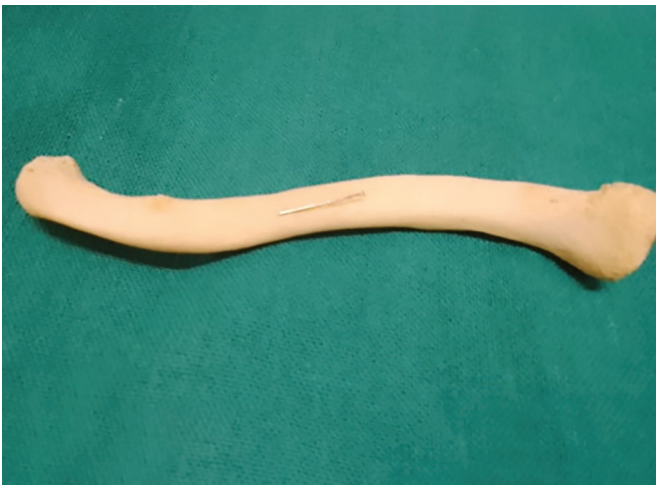
Fig. 4: Direction of nutrient foramen toward acromial end shown with inserted needle