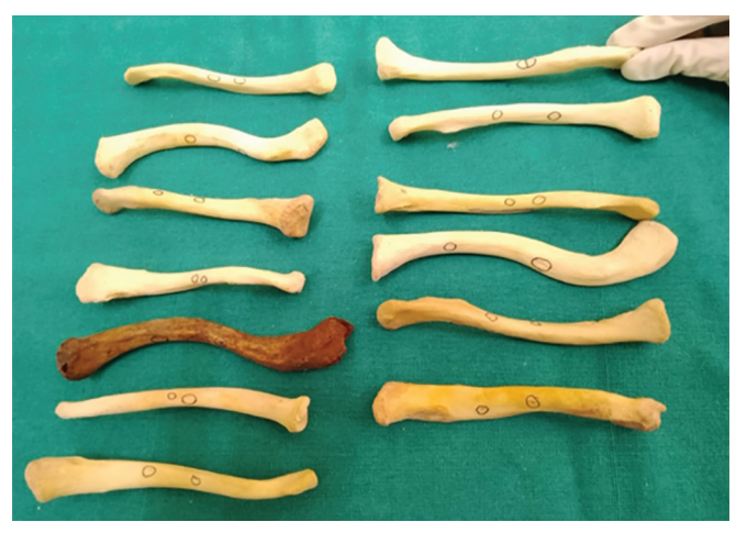
Fig. 2: Clavicle bones showing double foramina