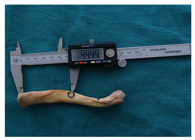
Fig. 1: Distance of nutrient foramen from sternal end

clavicles of right (22%) and 3 clavicles of left (6%) were noticed (Fig. 2). Three foramina in the total 7 clavicles present, out of which, 6 clavicles of right (12%), 1 clavicle of left (2%) (Table 1; Fig. 3) were observed. Foramina directed toward the acromial end were 76.5%