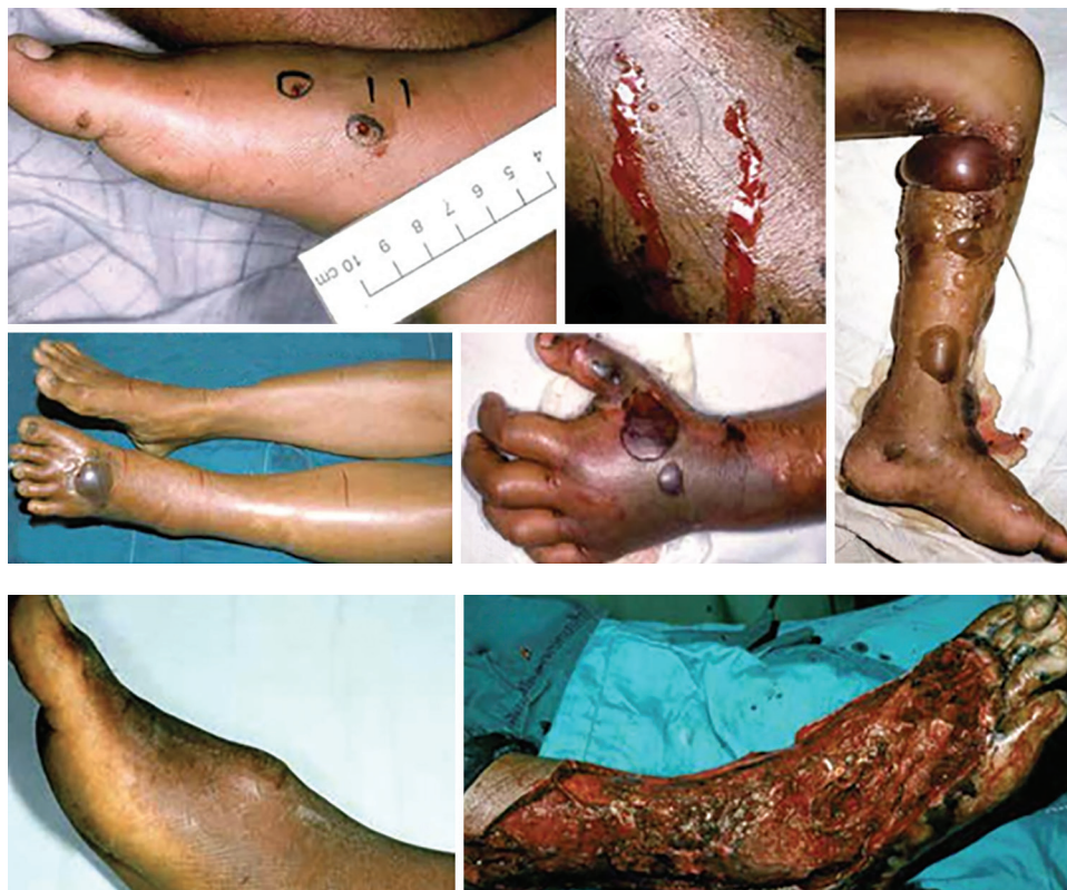
Fig. 1: Signs of local envenomation