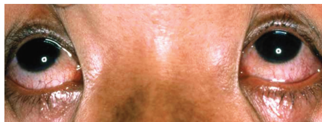
Fig. 5: Conjunctivitis associated with spat of venom

If the “spat” venom enters the eyes, there is immediate and persistent intense burning, stinging pain, followed by profuse watering of the eyes with the production of whitish discharge, congested conjunctivae, spasm and swelling of the eyelids, photophobia, clouding of vision or temporary blindness, corneal ulceration, permanent corneal scarring, and secondary endophthalmitis (Fig. 5).