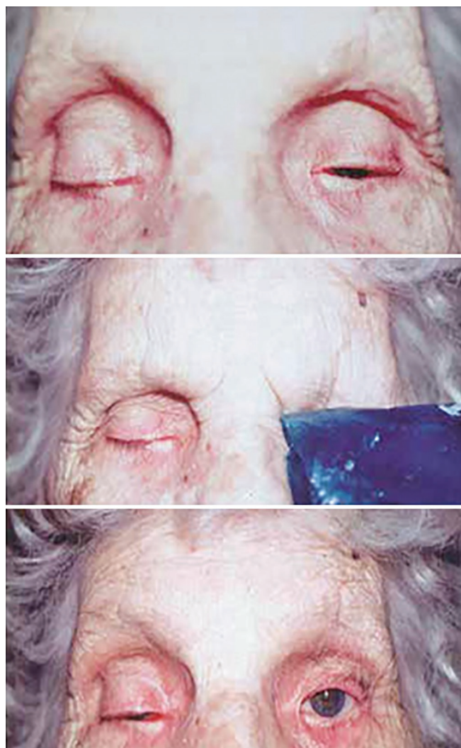
Fig. 7: Ice test for checking neurotoxicity (Delaney Y, Khooshabeh R, Benjamin L, 2002)

The "ice pack test" 13 as a "possible alternative to the Tensilon test" is recovery of ptosis in the one eye after applying an ice pad that inhibits intrinsic cholinesterase in a patient with postsynaptic blockade of neuromuscular